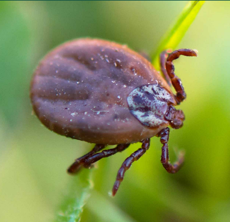
American dog tick ( Dermacentor variabilis )

Cases of tickborne diseases are on the rise in the United States, signaling a need for effective public health communication. In response, the PIE Center is exploring perceptions of tickborne diseases to develop educational programs on tick bite risks and prevention strategies.